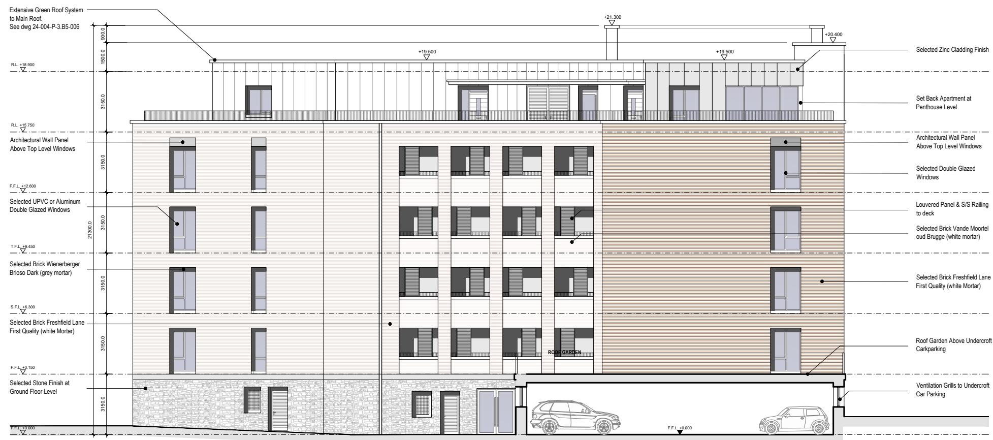
Apartment Block 05 - West Sectional Elevation Scale 1:200