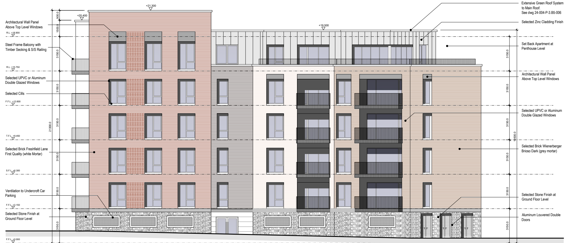
Apartment Block 05 - East Elevation Scale 1:200

Copyright: All Rights Reserved. This work is copyright and can not be reproduced or copied in any form or by any means (digital, electronic, graphic or mechanical including photocopying) without the express written permission of DDA Architects Ltd. Any licence, implied or express, to use this document for any purposes whatsoever is restricted to the terms of the appointment, agreed or written, between DDA Architects Ltd. and the instructing party. Levels: Levels and Contours are relative to Ordnance Survey Datum. Dimensions: Figured Dimensions only to be used. Specification: All drawings to be read in conjunction with Architects Specification.